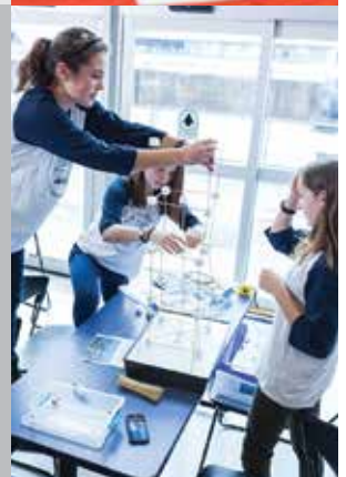
Plate tectonics affects the Earth and humankind. Take on the challenge of creating an earthquake-proof structure. Will it withstand the shockwave when it is put to the test?