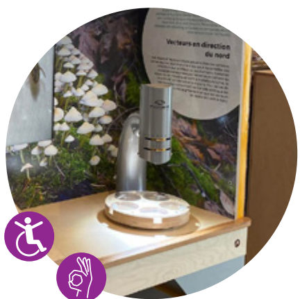
Spot the Vector