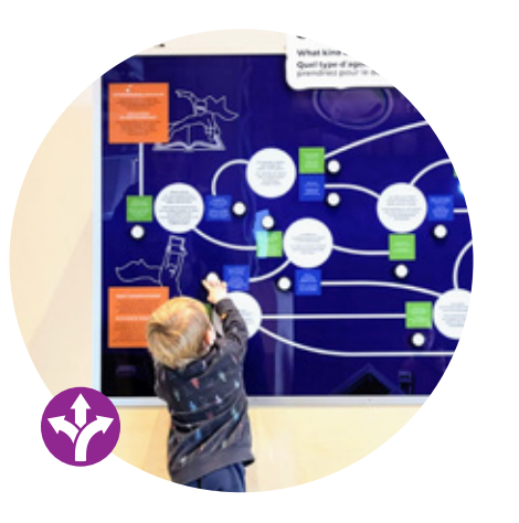
Paths to Action