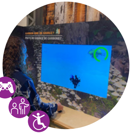
Carbon Sink or Source