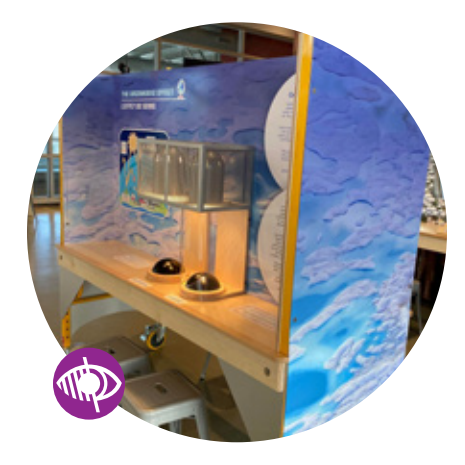
The Greenhouse Effect