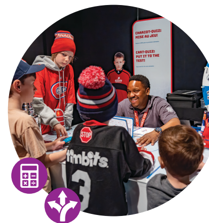
Hockey Face Off