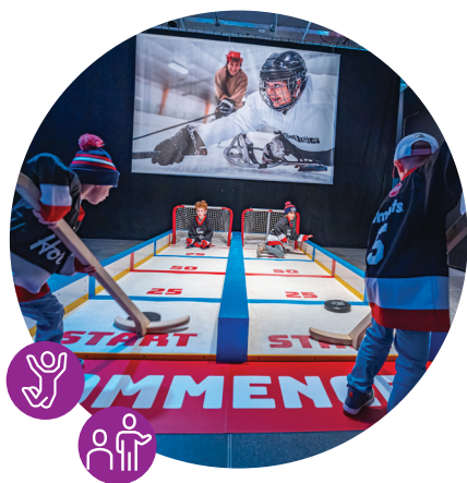
Slick as Ice